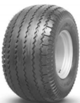
Cross ply tyres 500/50 – 17 TL Width: 503 mm Ø: 945 mm

We offer the correct tyres for every harvest condition. Flotation tyres offer a larger contact area and are therefore preferable in boggy terrain as they reduce compaction and make for lighter pulling.