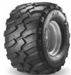
Radial ply tyres 710/40 R 22.5 TL Width: 727 mm Ø: 1,140 mm