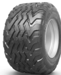
Radial ply tyres 620/40 R 22.5 TL Width: 610 mm Ø: 1,080 mm