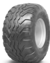
Cross ply tyres 500/50 R 17 TL Width: 503 mm Ø: 945 mm